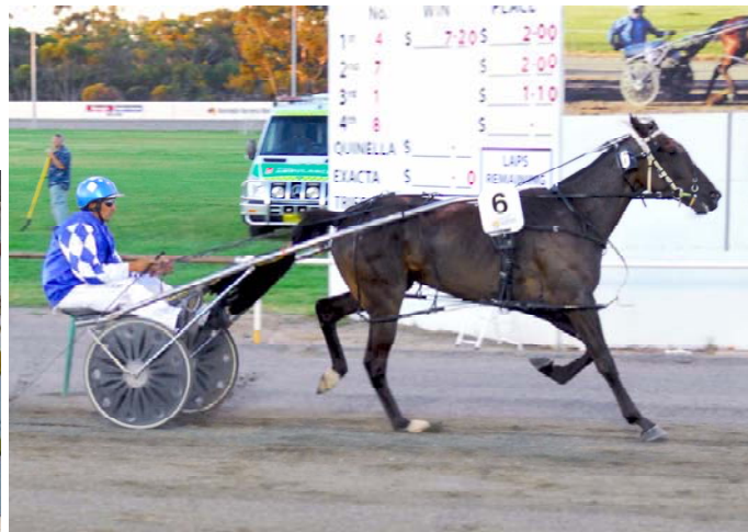
Westwind Renegade's runaway finish