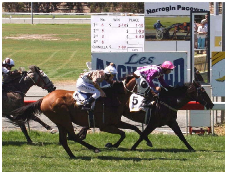
Cat Magic takes out the Bouvard Cruises Handicap